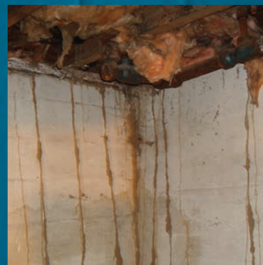
Mud tubes along the concrete wall of this damp basement allow termites to travel into the home above.